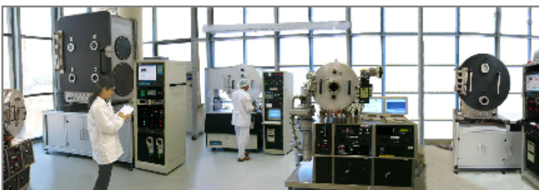
Acktar Vacuum Coating Department

Acktar Ltd. ( www.acktar.com ) is an industrial nanotechnology company established in 1994, Headquartered in Kiryat Gat - Israel, and with subsidiaries in Germany – ACM Coatings GmbH and in Japan – Acktar Japan Ltd. Acktar's core competence is the development and manufacture of extremely black coatings using proprietary Physical Vapor Deposition (PVD) based processes. The coatings can be deposited on virtually any substrate material and can achieve absorptance (specular) of above 99% in the UV, VIS and IR spectra. Acktar's coating processes are totally environmentally friendly and are in use by leading companies throughout the world in applications such as optical equipment, IR sensors/ systems, aerospace systems and solar thermal absorbers.